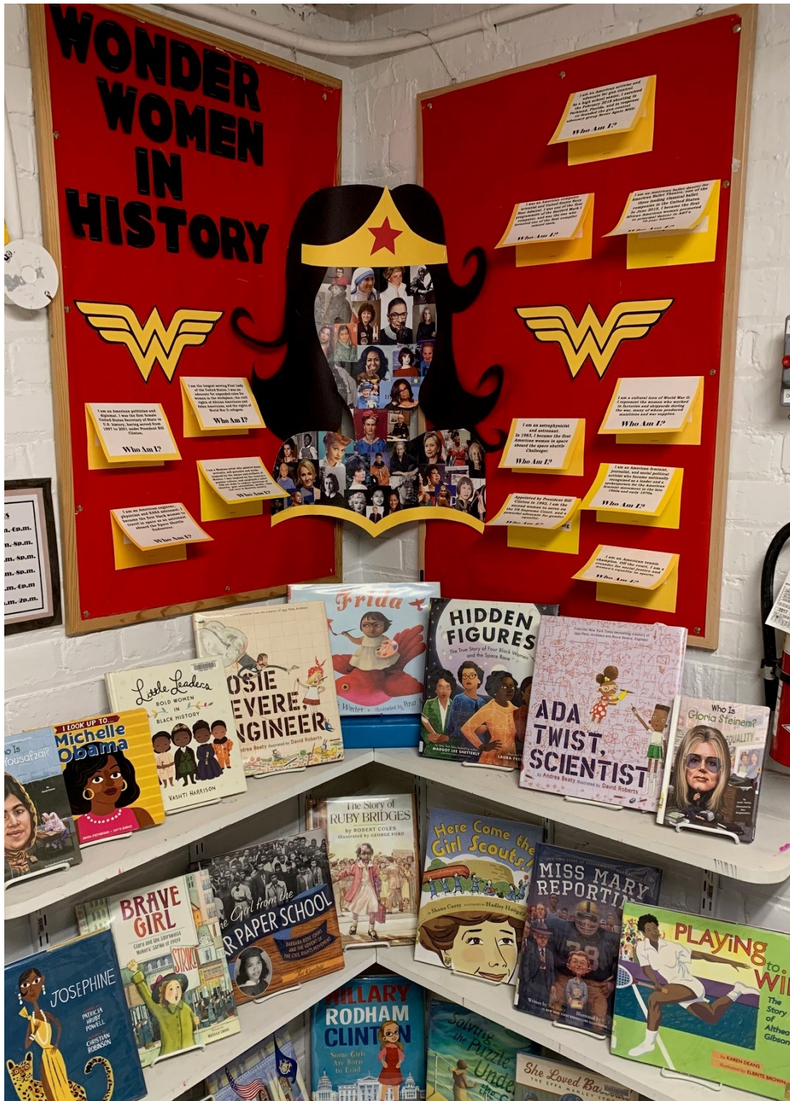
Meet some of the Wonder Women in History at the Wallkill Public Library for Women's History Month

Share a library-related photo, include a brief caption, your name, position and the library's name. A photo release is required from recognizable individuals in the photo. Click here for the RCLS photo release. Submit the picture to rclsmemo@rcls.org with 'Photo of the Week' in the subject line.