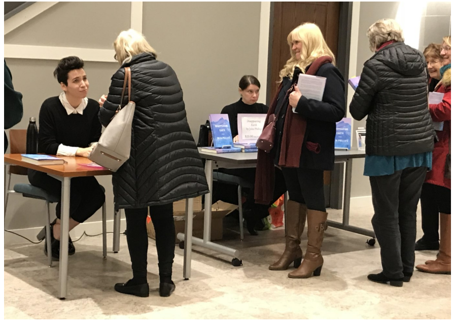
Audience members personally engage with the author while getting their books signed.